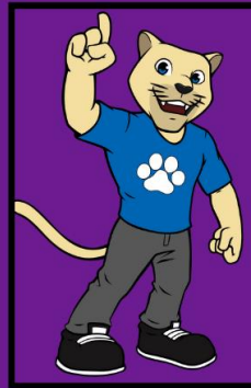
MR. PT PANTHER